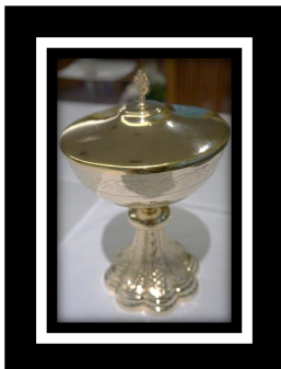
Ciborium - holds the Body of Christ