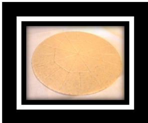
Large Host - To be placed on Father's paten