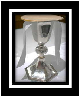
Chalice with paten and host