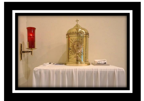
Tabernacle and Red Sacristy Light