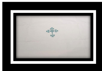
Corporal - Placed on the Altar