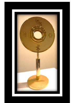
Monstrance - Holds the Blessed Sacrament for Exposition of the Eucharist