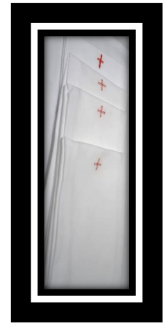
Purificators - used to wipe the Cup when serving the Blood of Christ