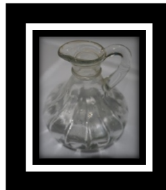
Cruet for water