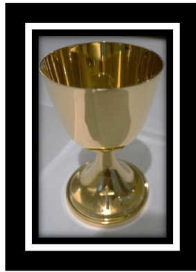
Cup - holds the Blood of Christ